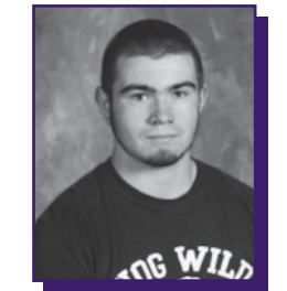
Bailey Parish Beef Production Placement