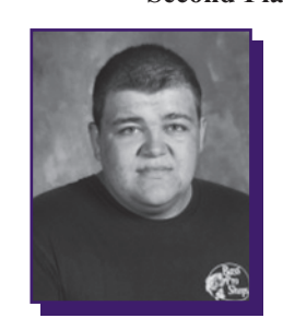
Colton Boots Agricultural Sales